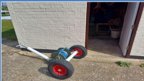
Start! Buggy & tackle reel kept in west store