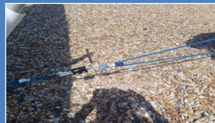
Step 9 Secure blue/white line to black cleat for 3 part purchase