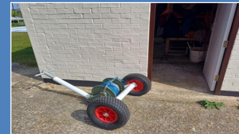
Finish - Return Trolley Buggy to west store

A catamaran version of this is in the design stage