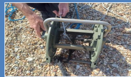
Step 10 Once boat is recovered, rewind blue/white line onto reel ready for next user