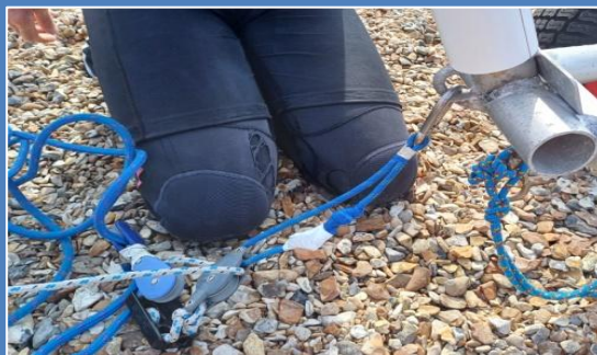
Step 5 With thick blue line set the reach down the beach