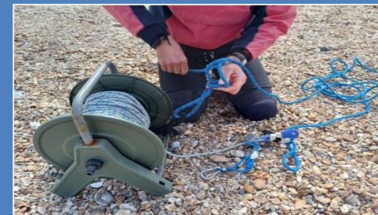
Step 3 Secure ramp stop to blue line with a bowline