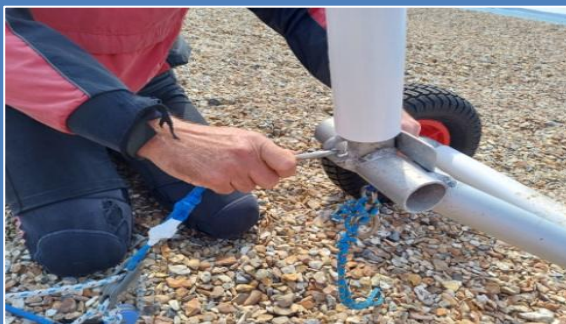
Step 4 Using snap shackle attach tackle to buggy