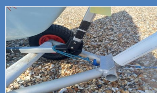
Step 7 Attach trolley buggy to boat trolley