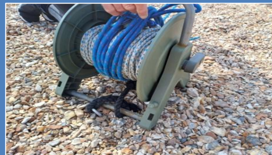
Step 2 Ramp stop fed underneath reel towards the sea