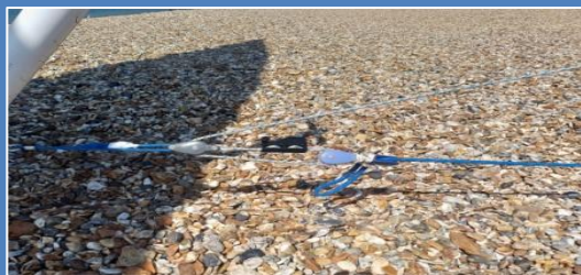
Step 8 Pull in the blue/ white line